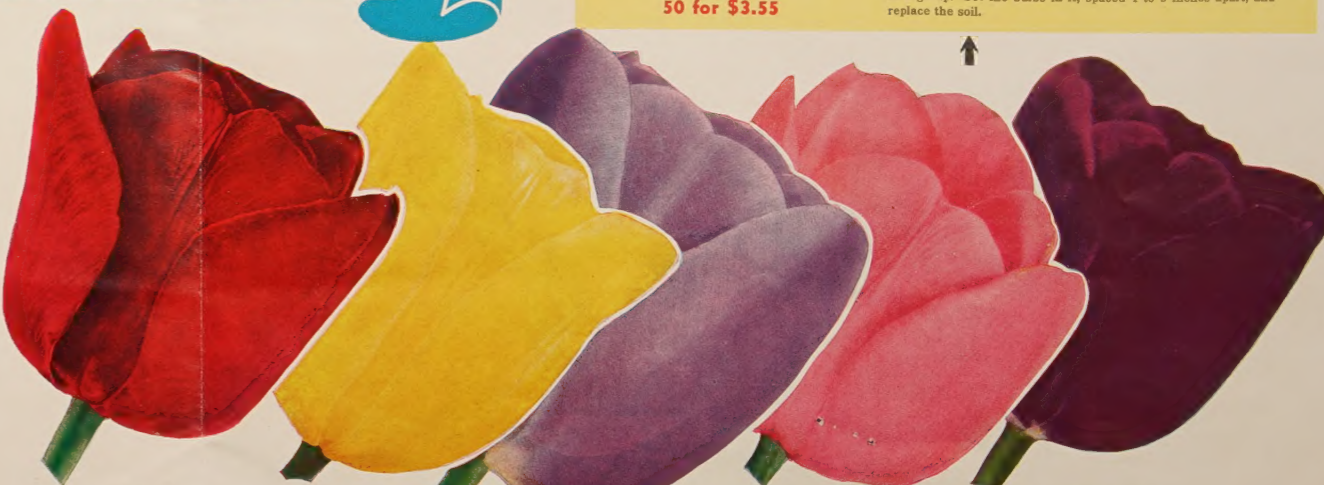
GLORIA SWANSON 12 for 95c NIPHETOS 12 for 95c SCOTCH LASSIE 12 for $1.00 CLARA BUTT 12 for 85c LA TULIPE NOIRE 12 for $1.00

COLLECTION J 5 bulbs each of the ten Blue Ribbon varieties 50 for $3.80